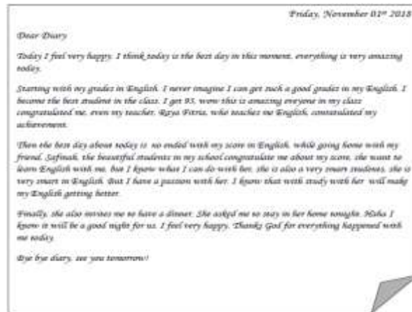
Figure 1: Suchman Inquiry model Adapted from ( Hamdy, 2009)

1- Discrepant Event: This is a type of problem that the students may know little to nothing about that is introduced by the teacher. Example: Why doesn't the snail inside this sealed terrarium die?