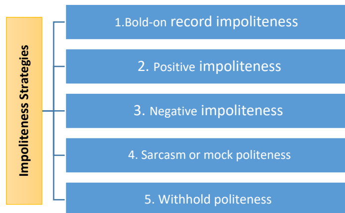
Figure (1): Culpeper's (1996, 2005) Impoliteness Strategies