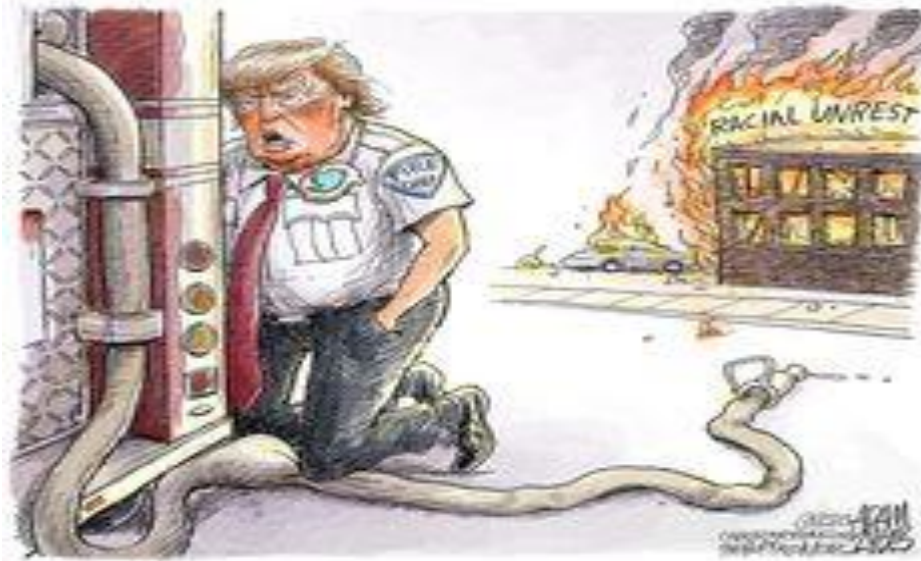
Figure 3: Racial Unrest

Among socio-political issues witnessed in America is racism. People think that Trump's policy has awakened racism in America. This issue has emerged after two police officers killed a black man called George Floyd in public. This has caused political and security instability. The situation becomes worse due to Trump's ignorance. This situation is clarified in the figure above, which shows Trump sitting on fire hose while the building behind him is burning. The expression "racial unrest" is written on the building behind Trump to indicate his carelessness to the issue of racism emerged in America after the killing of George Floyd.