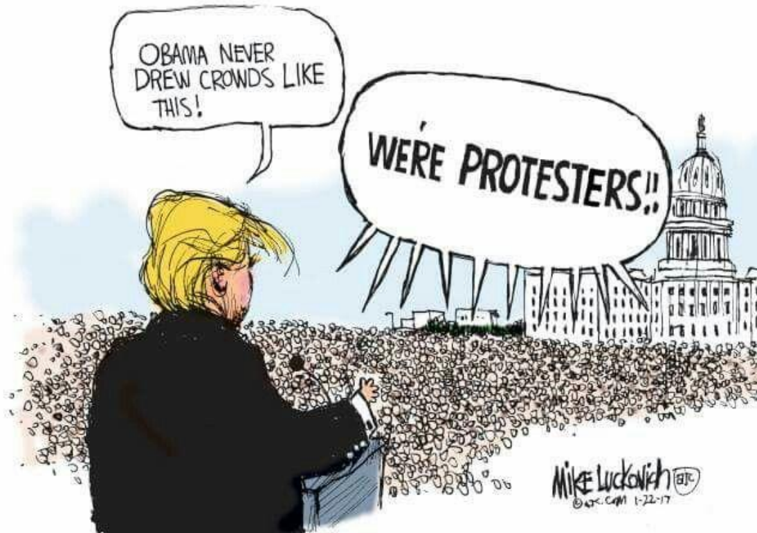
Figure 5: We Are Protesters

in a press meeting, speaking about the issue of corona virus. He says: "we are under attack from an invisible enemy!" The journalist says: "uhh... we can still see you, Mr. President". Here, the sentence uttered by the journalist reflects satire, referring that Trump is the invisible enemy.