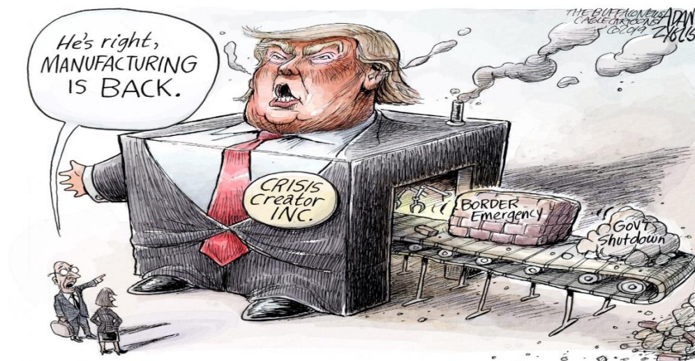
Figure 1: Crisis Creator

Satire is often used to achieve political or social changes, or to prevent them. Satire can be part of a given work; it can be the purpose of an entire text. Satire is of different types. Direct satire is serious, acting as a protest. Comical satire is used to get fun at something or someone. The data of this study is represented by political satirical cartoons on Donald Trump collected from websites. These cartoons contain satirical expressions, which are analyzed critically to highlight the purpose of satire denoted by them.