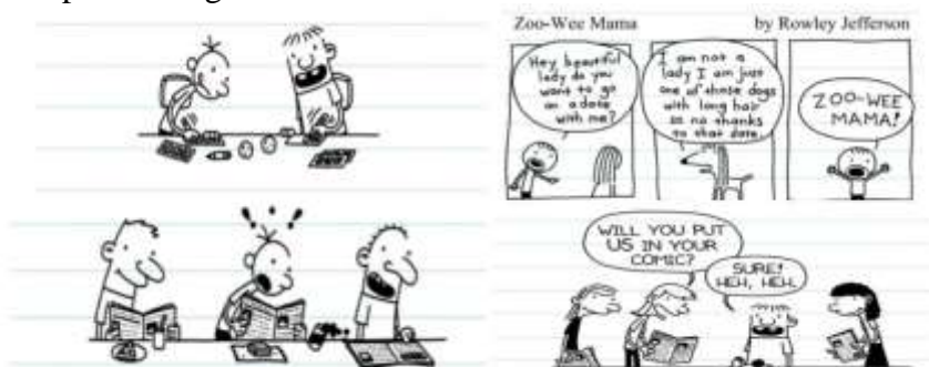
Figure (3) Zoo-Wee Mama

Rowley's drawing is chosen and published in the school newspaper, and Rowley becomes the new cartoonist. Rowley gets famous among students and has new friends. “So now Rowley's getting all the fame that was supposed to be mine.” (Kinney 2007:205). Greg gets jealous from Rowley's fame and feels lonely. Jealousy and loneliness prove Greg as anti-hero.