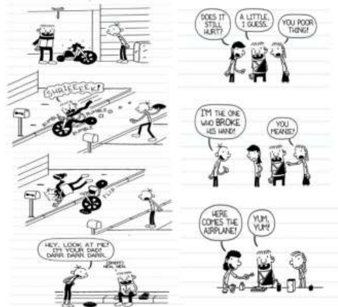
Figure (2) Big Wheel

Zoo-wee-mama is a comic cartoon appears in Diary of a Wimpy Kid . Through the novel, the school announces to choose a new cartoonist for the school newspaper. Greg and Rowley register to be the cartoonist of newspaper. Greg thinks that this is his chance to be famous and get popularity since he is talented at drawing. Rowley cartoon is Zoo-wee-mama which originally is the idea of Greg. Rowley continuous drawing the cartoon even after Greg abandons it. Greg all the time tries to draw something different “I told Rowley maybe we should come up with some new ideas, but he just wanted to keep writing Zoo-Wee Mamas” (Kinney 2007:170).