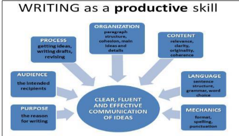
Figure (2) Elements of writing Scrivener (2005).